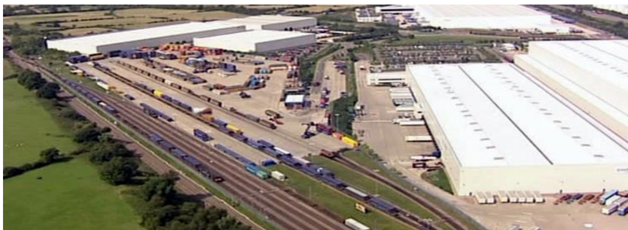
DIRFT – the UK's largest rail connected logistics park near Rugby

In the deep sea and domestic container intermodal markets, there has been a recent expansion of capability at both Lawley St Freightliner depot in Birmingham and at the major Daventry International Rail freight Terminal (DIRFT) south of Rugby.