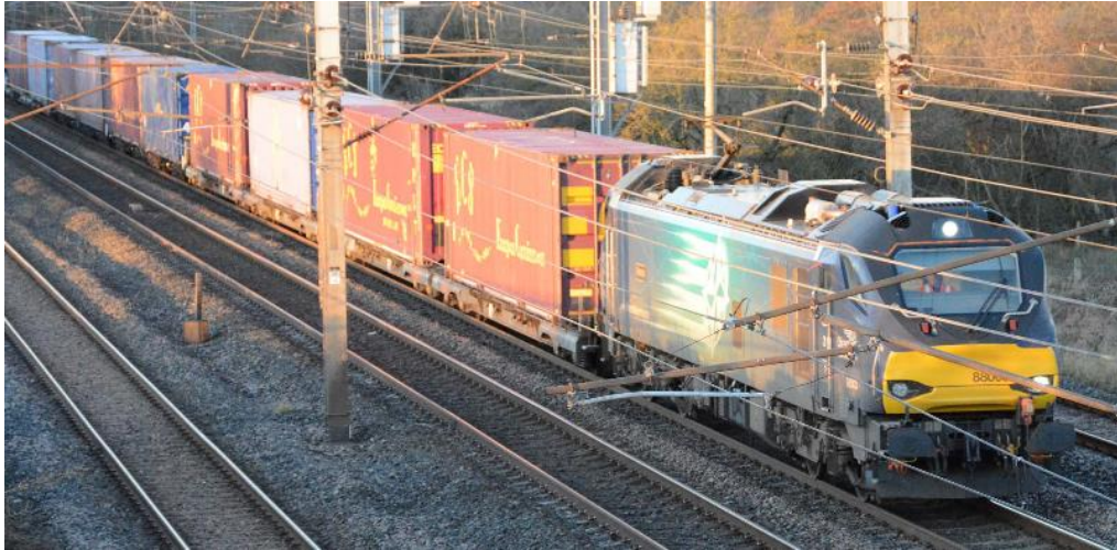
DRS Class 88 can operate on electric or (at reduced power) on diesel

DRS now have 10 Stadler Class 88 Electro-Diesel locomotives in service which have a small on-board diesel engine.