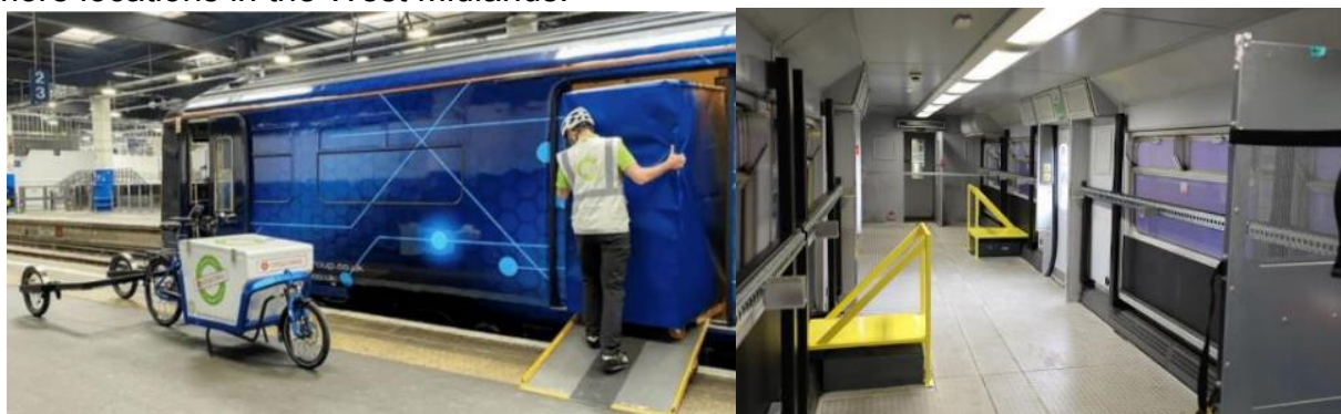
Orion (left) and Swift Express (right) use same basic concept of repurposing former passenger trains

The "Orion" train has been showcased at Hams Hall (Coleshill) and further new operators/customers/routes are set to be announced this year, hopefully including one or more locations in the West Midlands.