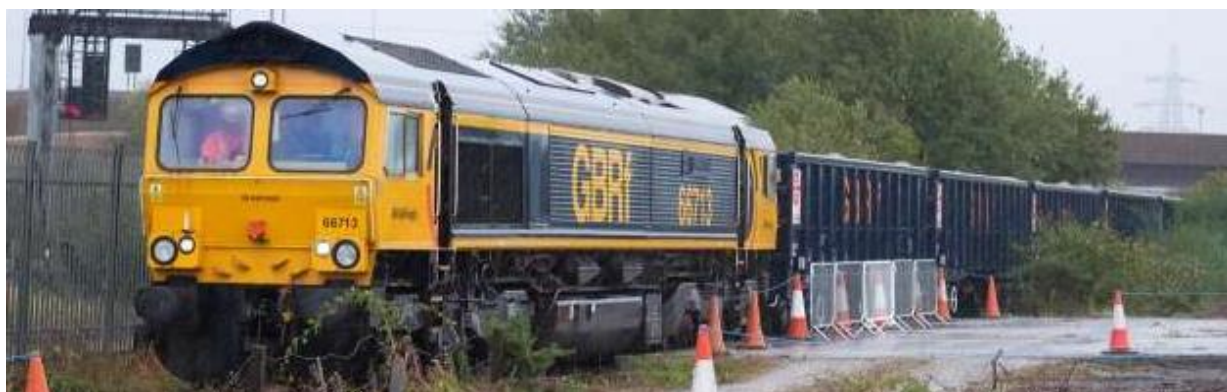
First HS2 aggregates train into new Balfour Beatty VINCI terminal 20/05/2020

To support new construction in central Birmingham, a second aggregates terminal (for Cemex) has recently opened alongside the existing Lafarge terminal at Small Heath, whilst at Washwood Heath two new terminals for Balfour Beatty VINCI (for HS2) and Tarmac have also come on stream since 2020.