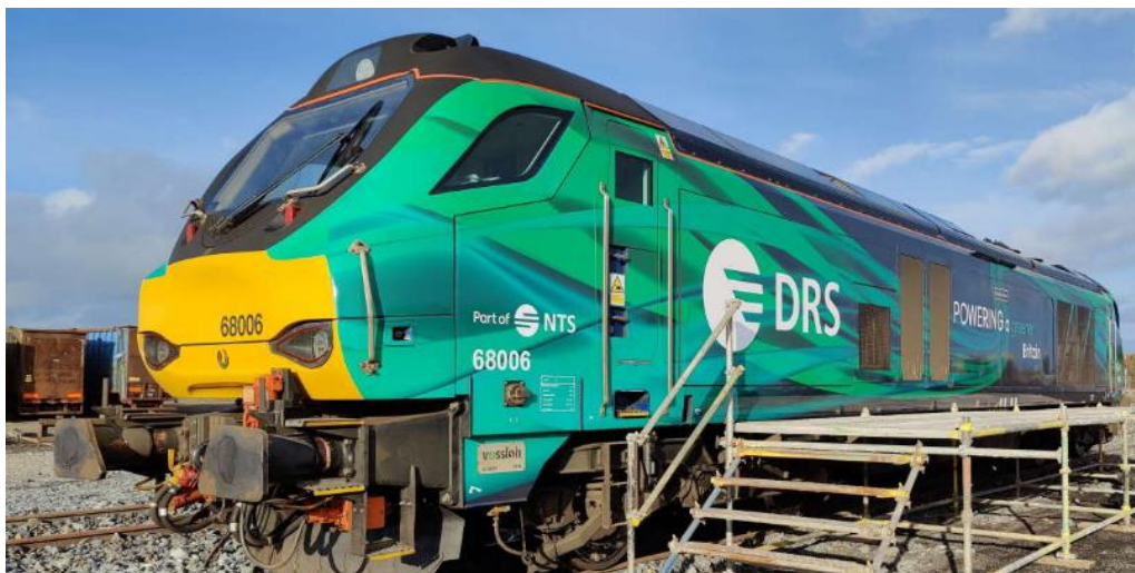
DRS Locomotive Testing HVO Biofuel

Trials of Hydrotreated Vegetable Oil (HVO) biofuel alternative to diesel have been undertaken recently, but the key disadvantage though is the higher cost of HVO.